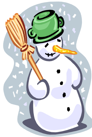
A Christmas Organizing Center can be portable so you can take it with you throughout the year

Next, decide if your center needs to be portable or not. Portable centers can be kept in a large basket, tote bag, crate, etc. If you like to work on your organizing in one location find a shelf near your area you can place your items on. If the shelf is out in the open, dress it up! Let it be known this is your Christmas Organizing center to others and a reminder to yourself to work on your holiday plan.