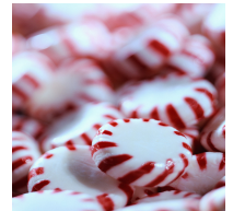
Candy Cane Seeds

Planning and organizing your Christmas NOW will help you reach your Christmas dreams!